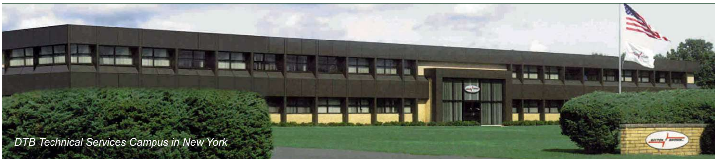
DTB Technical Services Campus in New York